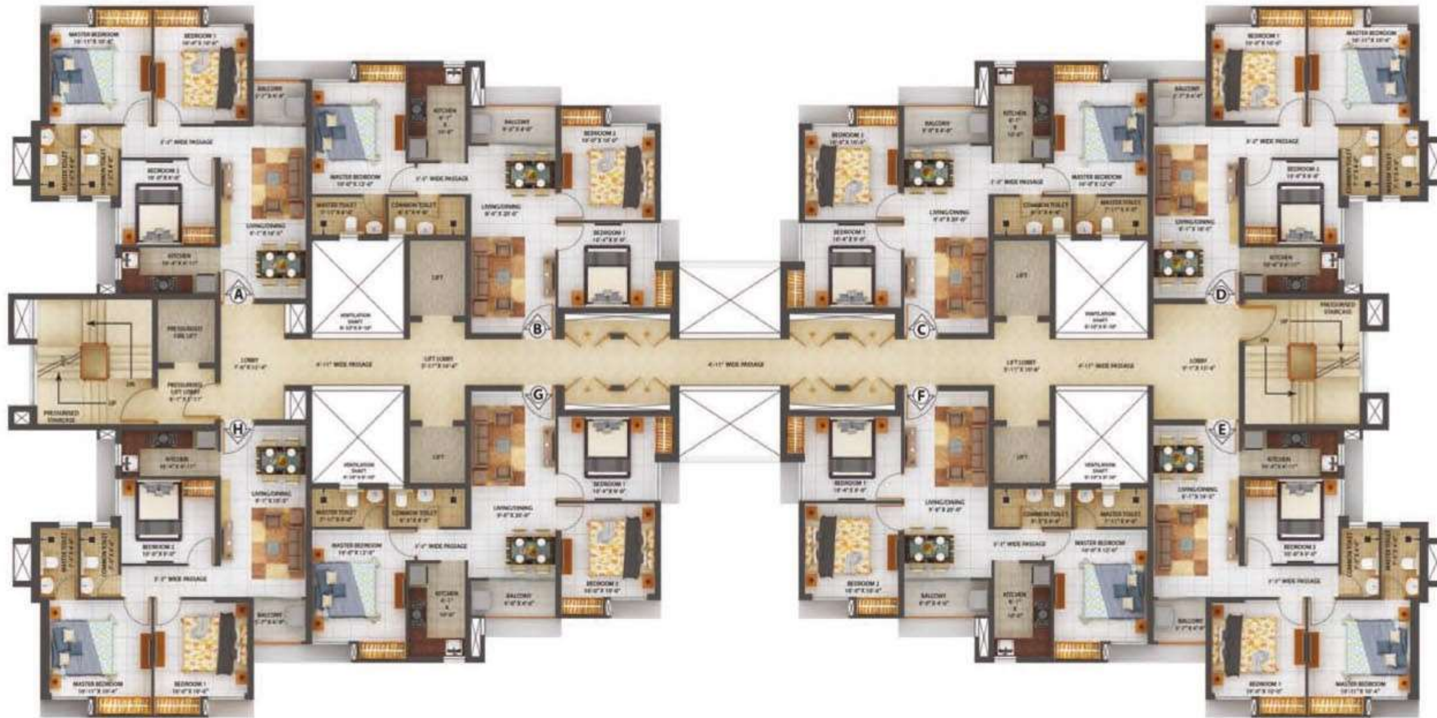
BLOCK B1 (2B+G+27) | Typical Floor Plan - 2nd to 27th Floor