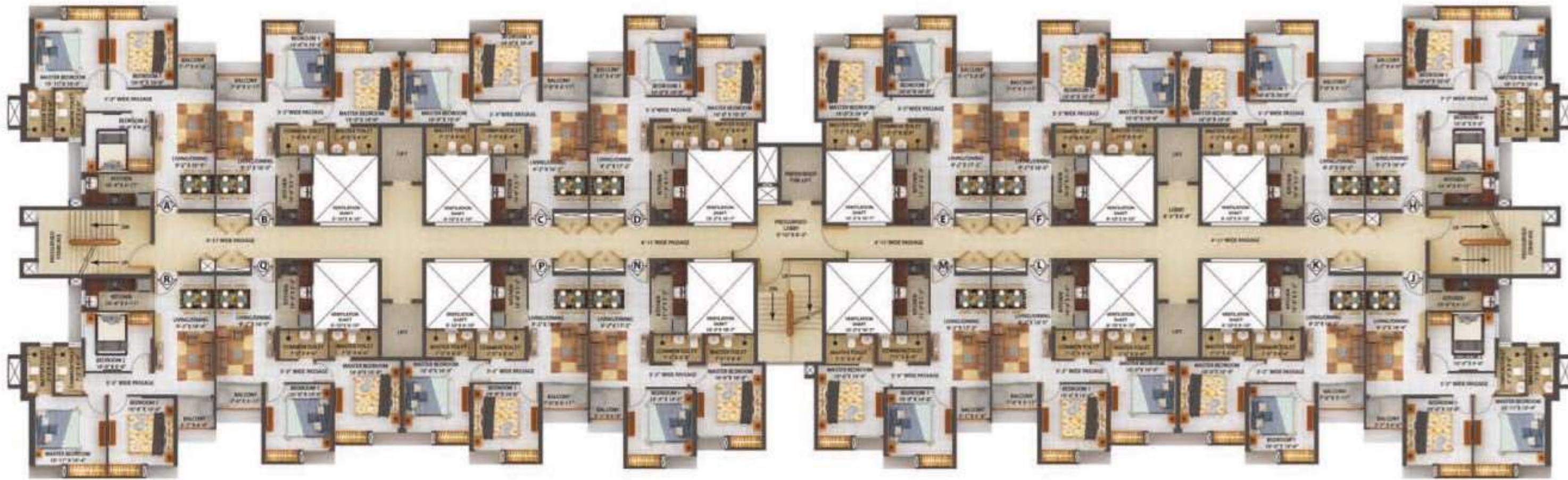
BLOCK A2 (2B+G+27) | Typical Floor Plan - 2nd to 27th Floor